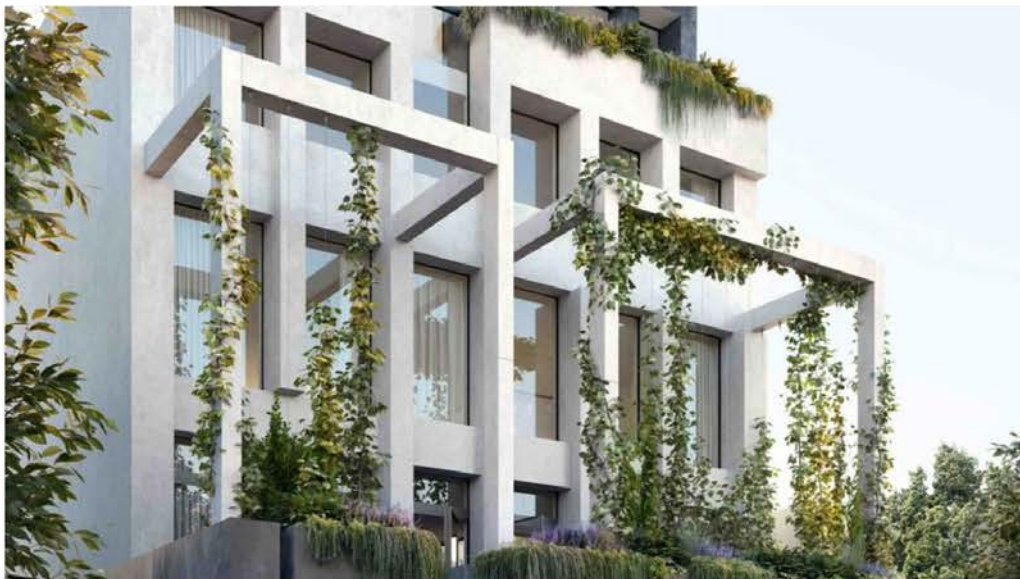
Artist's impression of the No. 94 River St apartments in South Yarra.

A flat in Maida Vale, London. I rented the broom closet off the kitchen. There was room for a single bed and a tiny chest of drawers with all my clothes neatly folded in colour-coordinated piles on the pantry shelves. I loved that room. It had perfect proximity to the kitchen and a late-night cuppa.