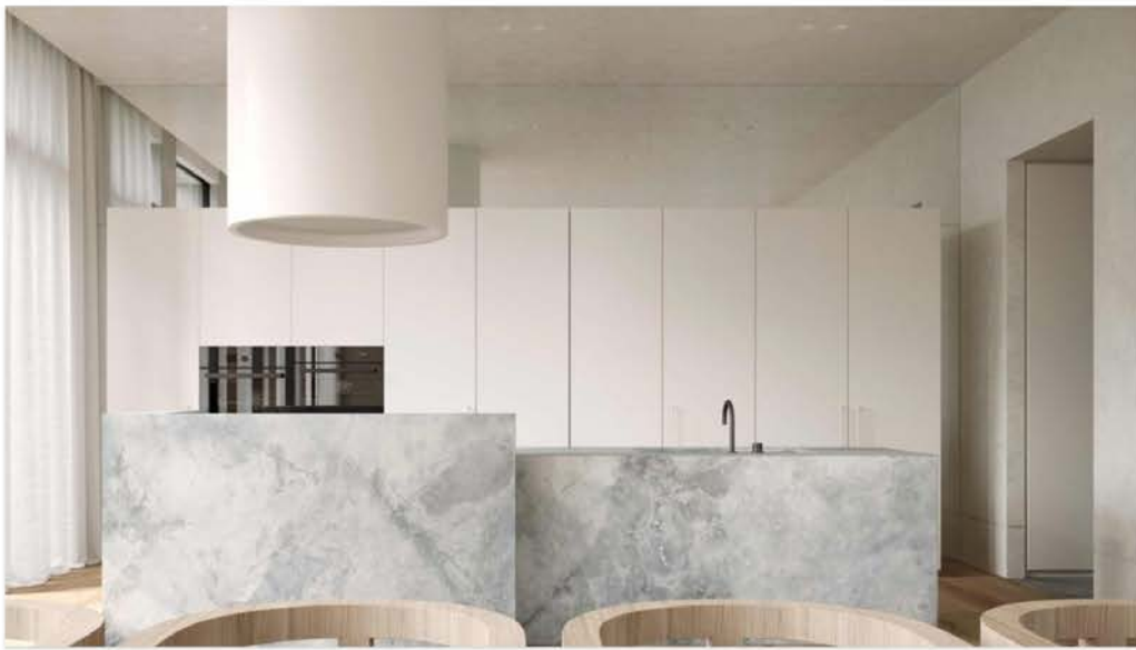
The South Yarra development is Paul Hecker's most recent interior design project.

Emulation Hall: Egypt style for sale in Canterbury at old Masonic hall