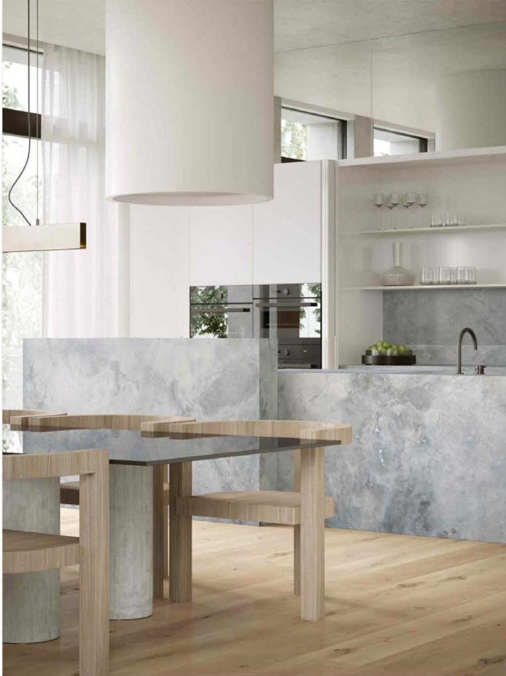
What No. 94 River St will look like inside.

Getting plumbing fixed, especially having to wait around after receiving a message like, "We will arrive any time between 9am and 1pm".